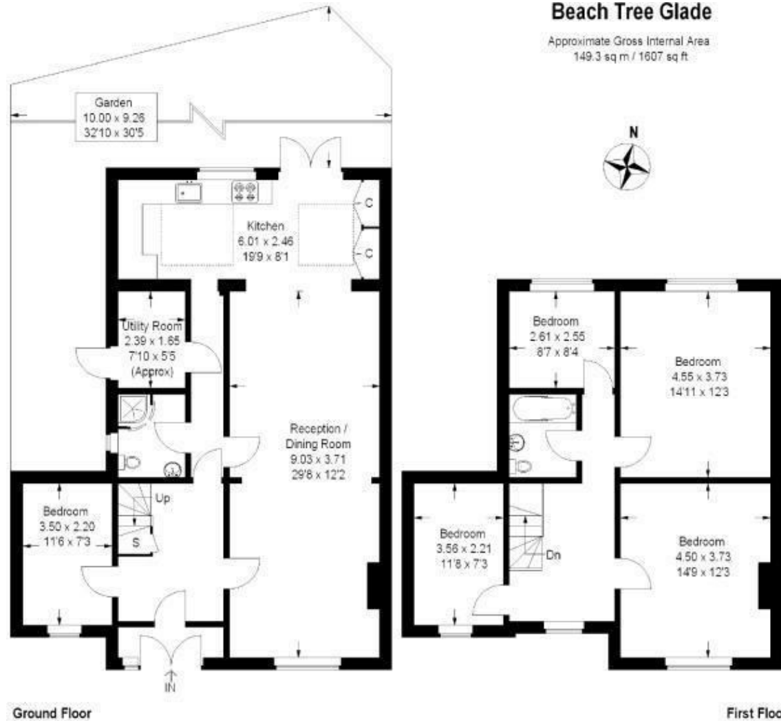
Illustration for identification purposes only, measurements are approximate, not to scale. FloorplansUsketch.com © 2015 (ID185442)

Approximate Gross Internal Area 149.3 sq m / 1607 sq ft